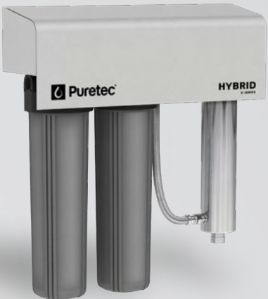
HYBRID G7 (AU) | G9 (NZ)

DUAL STAGE, 10" MODEL 75 Lpm • 1" Connection • Power Surge Protection