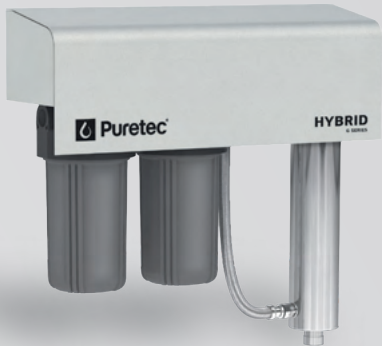
HYBRID G6 (AU) | G8 (NZ)

TRIPLE STAGE, 10" MODEL 120 Lpm • 1" Connection • Power Surge Protection